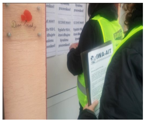
(Slovakia, PA and visitors from IWA)