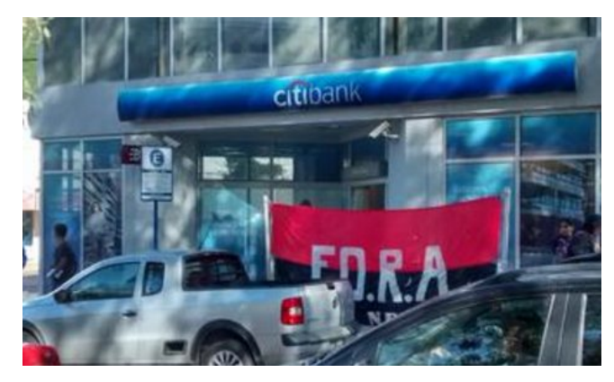
(Spain, Argentina. Below, Poland.)