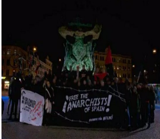
(Serbia, Sweden, UK, France)