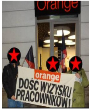
(Spain, France, Poland)

The call for action at Amazon, Manpower and Adecco was related to campaigns of the ZSP union at Amazon, where a majority of members were employed through Manpower or Adecco work agencies. Many workers at Amazon had late payments, were underpaid or lacked elements of their salary, such as payment for vacation, sick days or time scheduled but with no work. As a result of various protests, around 30 workers received what was owed to them and both Amazon and the work agencies had to be more careful. Manpower lost its contract with Amazon, but later started to be used again. Actions were held by IWA affiliates in the UK, Slovakia, Spain, Norway and Brazil and also be other good comrades from Czech Republic, Croatia and the US. The union continues to work in the company, dealing with such issues, which fortunately are less common and trying to organize more people.