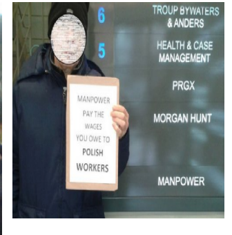
(Spain, Brazil, UK)