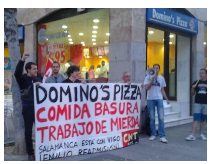
Repression and Solidarity

The CNT won a settlement with Dominos Pizza who dismissed a member.