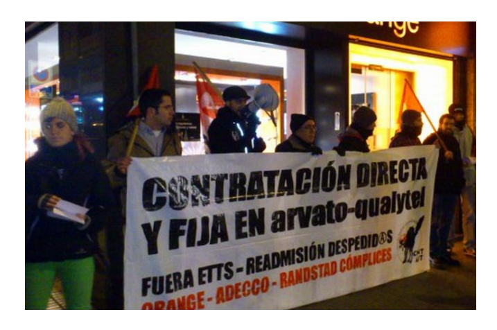
More photos from the actions: http://salamanca.cnt.es/2015/01/20/primer-asalto-delcombate-contra-arvato-qualytel